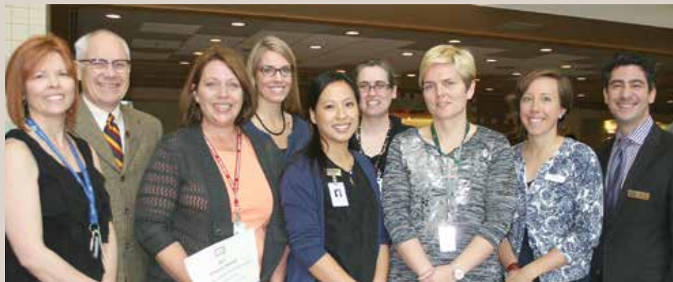
A few of SPH Foundation 2013 Professional Development Award Recipients with members from the SPH and SPH Foundation Volunteer Boards of Directors.