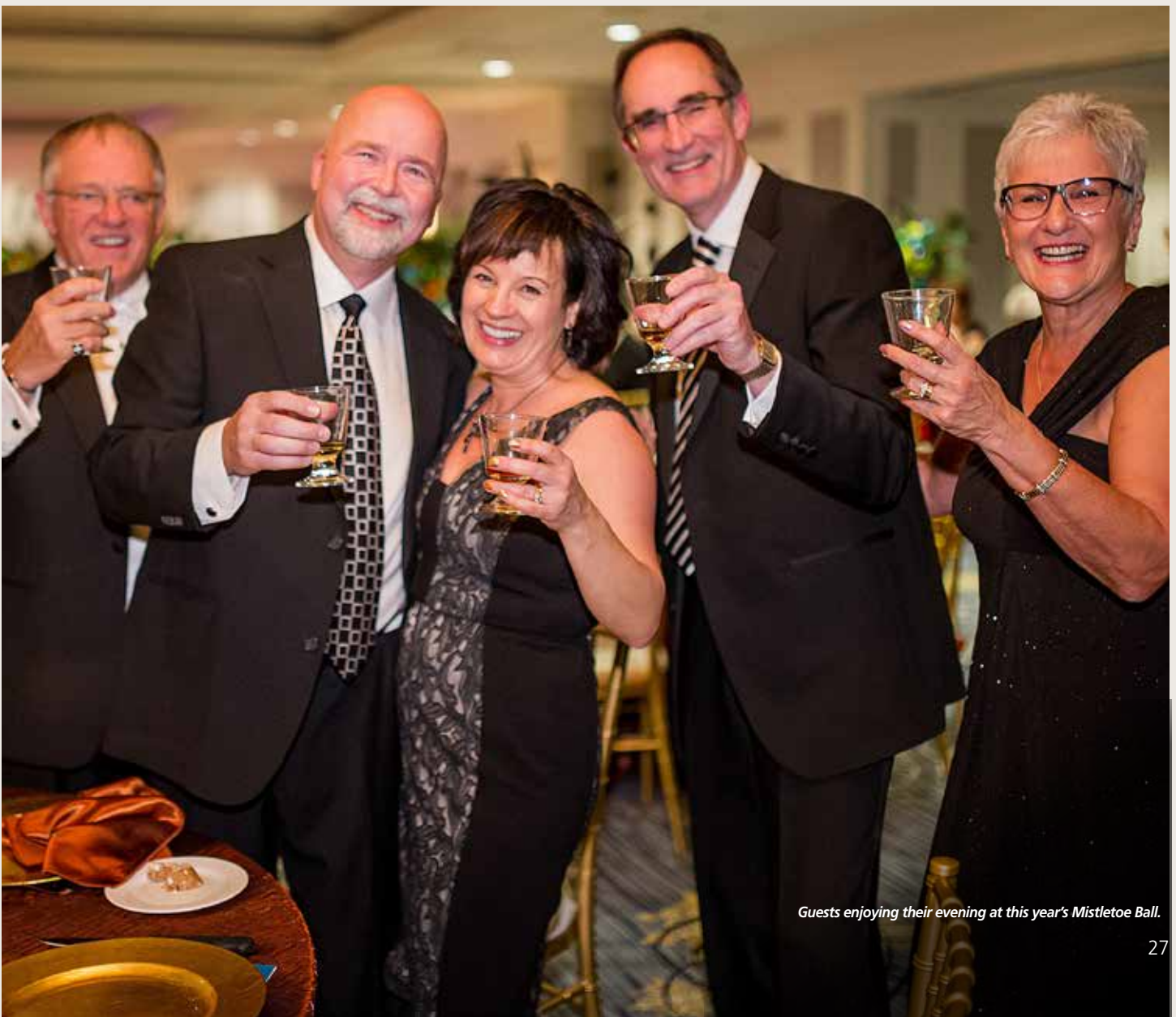
Guests enjoying their evening at this year's Mistletoe Ball.