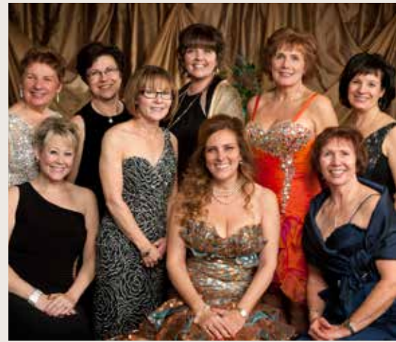
2013 Mistletoe Ball Committee

more than $1.5 million for St. Paul's Hospital Foundation. The success of the event would not be possible without the ongoing dedication and support of a committed volunteer group. We look forward to an exciting year ahead with the upcoming 25th anniversary of the Mistletoe Ball.